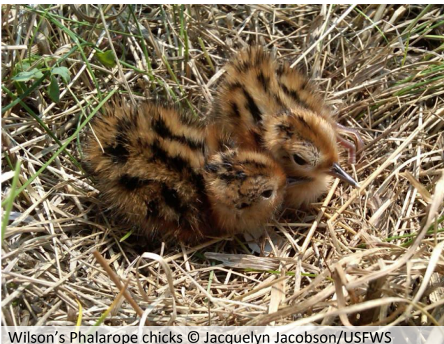
Wilson's Phalarope chicks