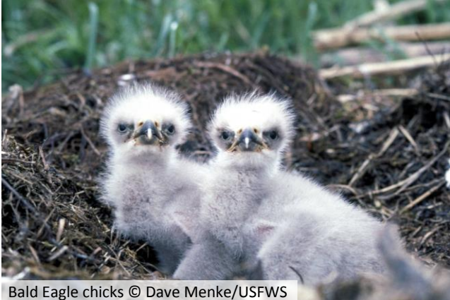
Bald Eagle chicks