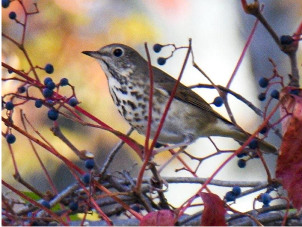
Gray-cheeked Thrush

THRUSHES AND MIMICS. This group is a mixed bag. Most are absent in winter. These include Gray-cheeked , Swainson's , Hermit , and Wood Thrush ; Gray Catbird ; and Brown Thrasher . This year we were lucky and got the two least common on that list, Gray-cheeked Thrush (1/17 DRT LaGrange MK) and Swainson's Thrush (1/1 Thompson Ln SR; 2/13 Nuclear Lk CP). There were 5 records of Hermit Thrush : 1/1 Mills/Hopeland SR; 1/6 Peach Hill, AL; 1/16 near Verbank BB; 1/19 CIES KH; 1/19 LaGrange CV. No one reported Wood Thrush , so all of those must all have left in September. Gray Catbirds were reported through the 26 th , which is normal. Brown Thrashers have moved on also; this species was reported only once: 1/6 Peach Hill, AL. We look forward to seeing them again in the spring!