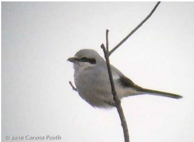
Northern Shrike

Eastern Phoebe: 1/18 Ring Rd Salt Pt LM (only record). Northern Shrike: 1/9 Strauss Marsh HT, CP, CV (only record)