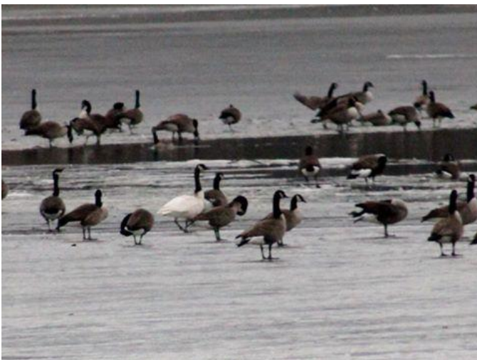
Leucistic Canada Goose

WATERFOWL – Temperatures dropped quickly the second week of December freezing many ponds and lakes, and there was some ice north in the river. 2 reports of Cackling Geese : 1/9 Hunn's Lake DK and 1/22 Sylvan Lake CP. A Greater White-fronted Goose was amongst the Canada Geese 1/4 The Fly DK. On the 21 st , Peter Stewart sighted several skeins of Snow Geese numbering over 3000 heading south over Red Hook. On the 16 th many others saw/photographed a large skein of over 250 flying south over Poughkeepsie during the CBC whilst Carena and Herb found a flock of around 600 on Redwing Beekman earlier that morning. The last reported Wood Duck were 2/10 at Norrie Point (SP,CP). American Wigeon 3/9 Drake Lake (LM), Northern Pintail (max 11/1 The Fly, CV, 6/13 Round Pond (DF), Bufflehead – 5 records 2/9 Hunns Lk (Bma, SJ), Common Goldeneye – 2 records 1/20 Sylvan Lk (CP), Hooded Mergansers – high counts 61/4 Rudd Pd (DK), 46/28 Whaley Lk CP; Common Mergansers 40 records max 64/20 Norrie Pt (SP,CP) 39/1 Hunn's Lk DK, 36 Dennings Pt OB; Ruddy Duck 10 records Max 18/21 Redwing Beekman CP. It was an American Black Duck show on the 11 th with 120 seen on Stissing Pond by CP,HT (33 records total, avg 12 each).